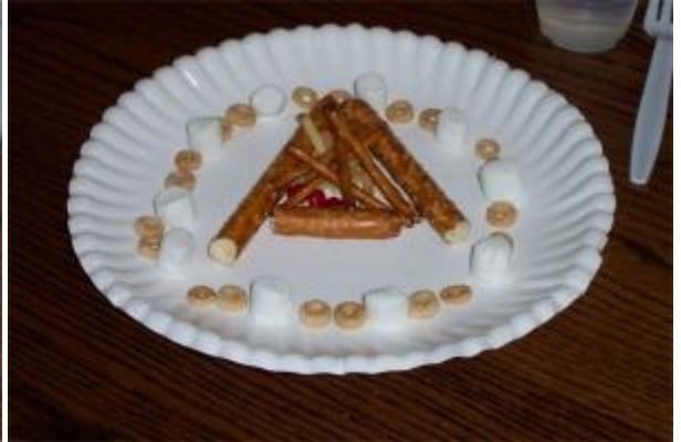
Now the fire is burning brightly Completed Edible Fire!